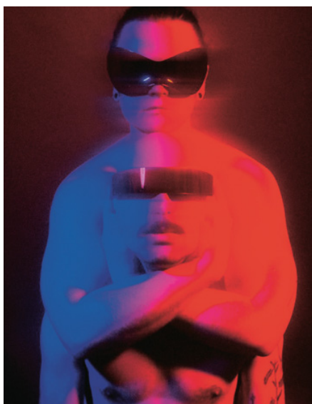
„DJ“-Duo Slutty Saints