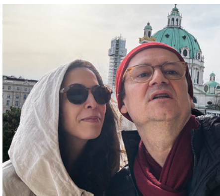
popfest curators' disco